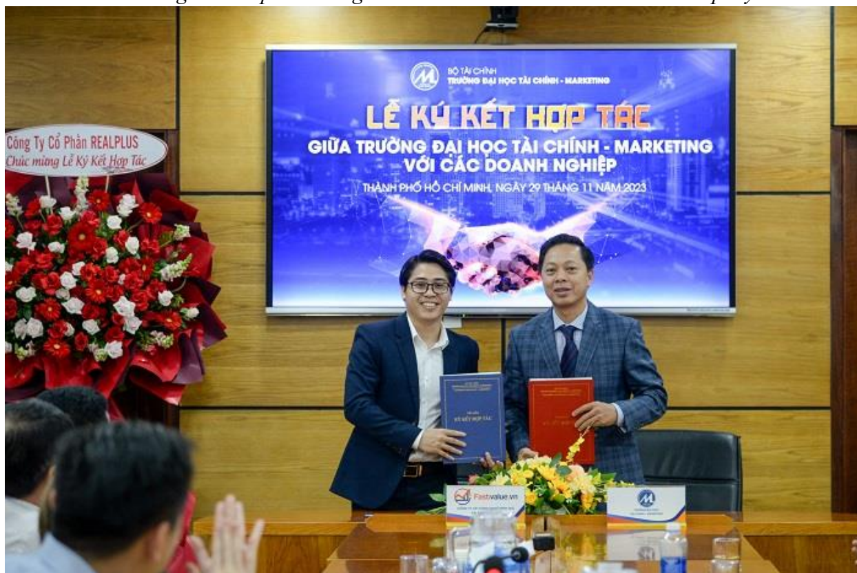
UFM signs a cooperation agreement with Vietnam Asset Valuation Technology – FastValue Company