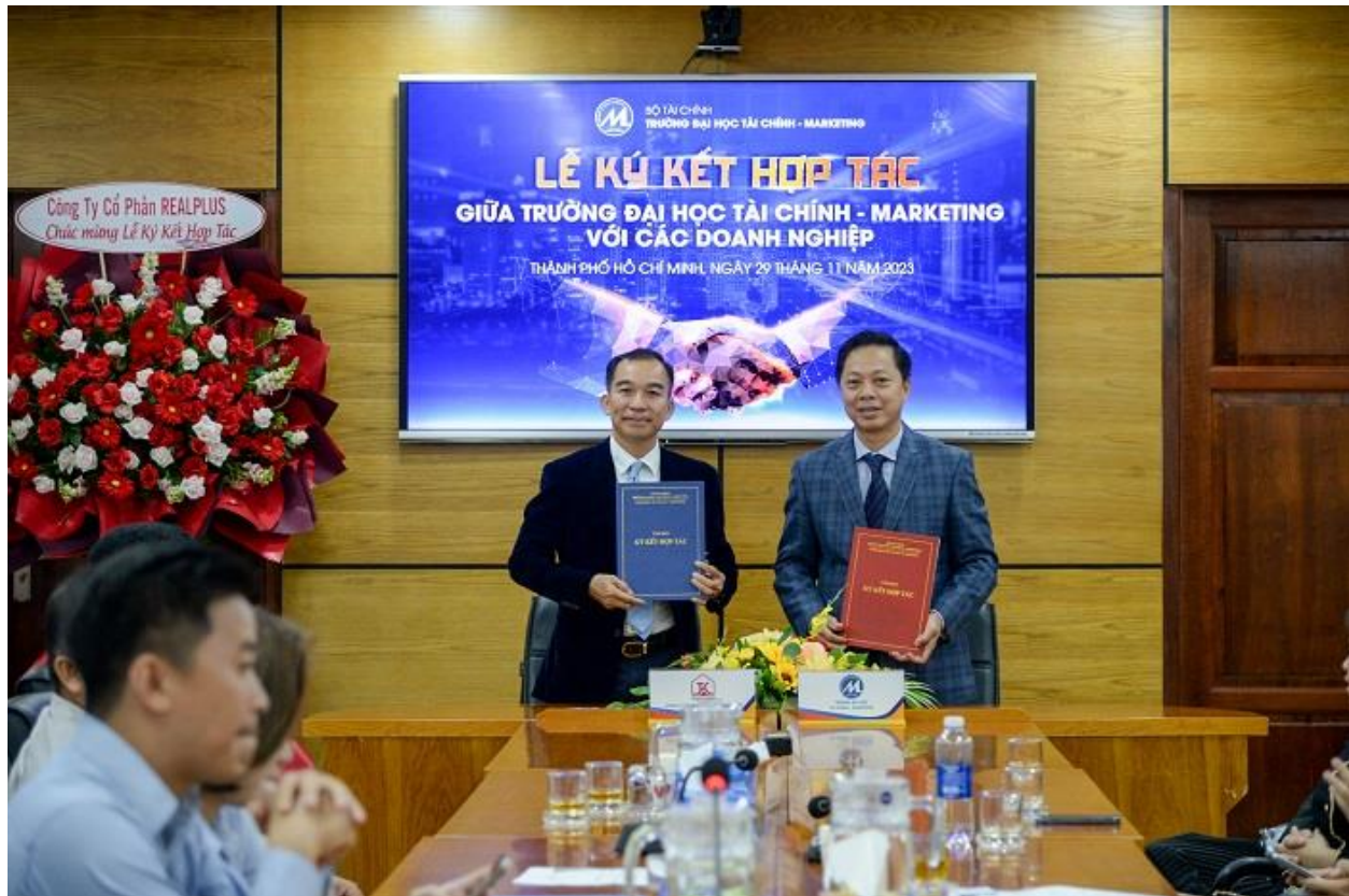
UFM signs a cooperation agreement with Sunvalue Valuation Group.

At the signing ceremony, the parties also discussed specific contents outlined in the memorandum of cooperation and expressed hope for early implementation in the near future. Notably, most of the companies signing the cooperation agreements this time are alumni of the Faculty of Valuation - Real Estate, who have returned to the University to accompany the students of the department and the University on the upcoming journey.