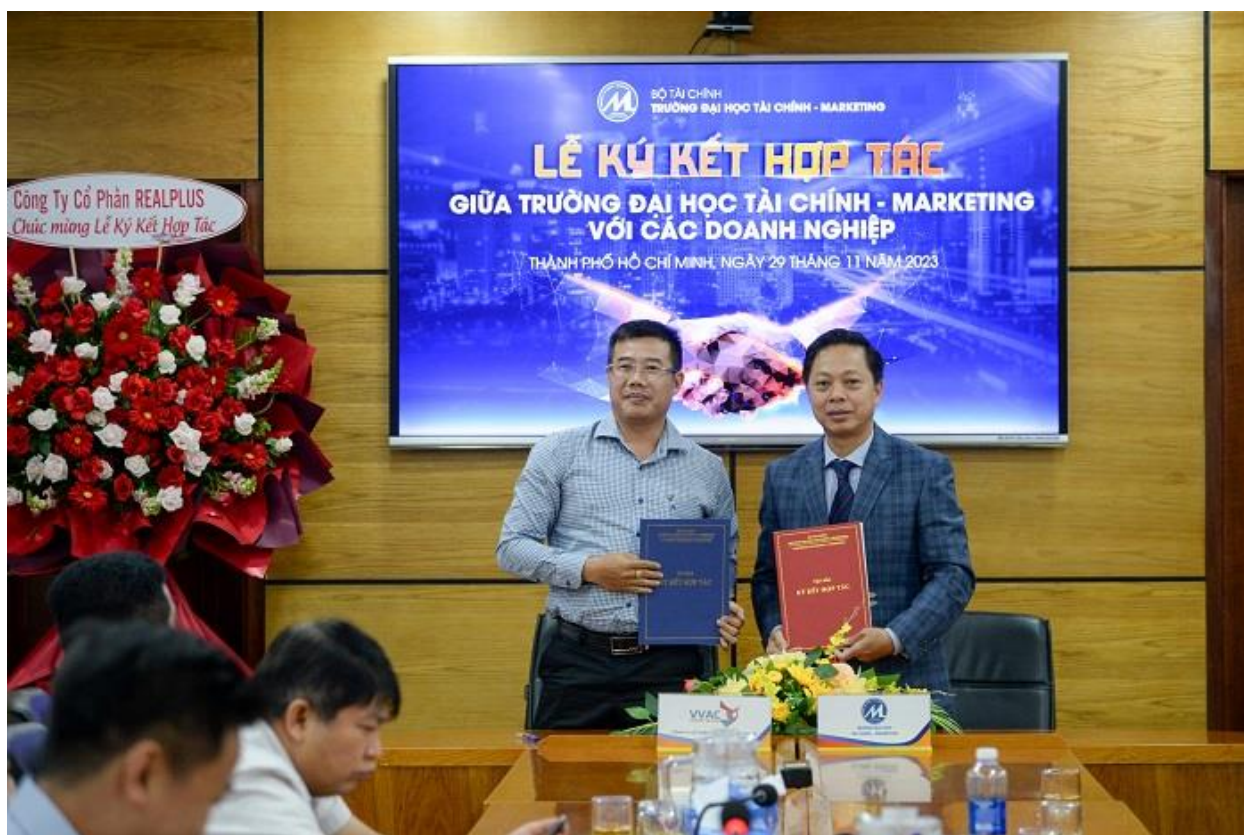
Ceremony of cooperation agreement between UFM and Vietnam Valuation Company