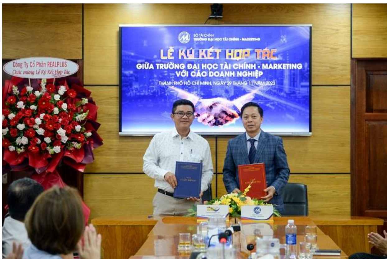
Ceremony of cooperation agreement between UFM and SAG Valuation Limited Company